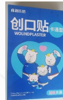
Adhesive Bandage for vaccination