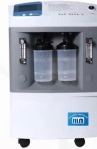
Medical Oxygen Generator