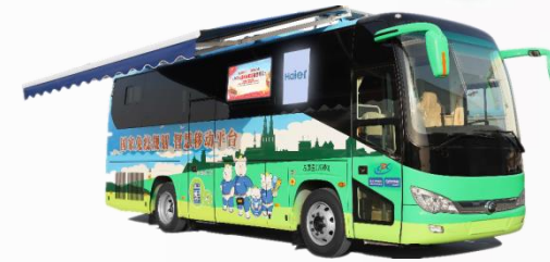
Mobile Vaccination Vehicle