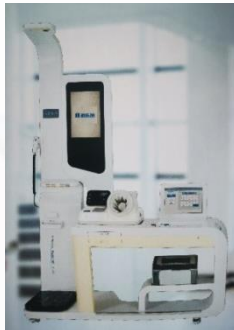
All-in-one Health Examination Unit