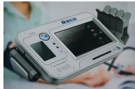
Follow-up Health Examination System